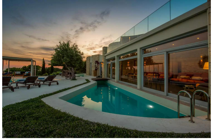
Showing first 18 photos.