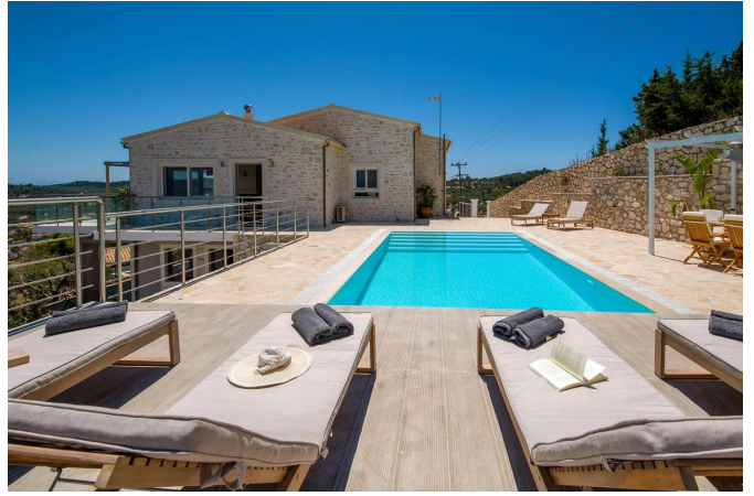
Showing first 18 photos.