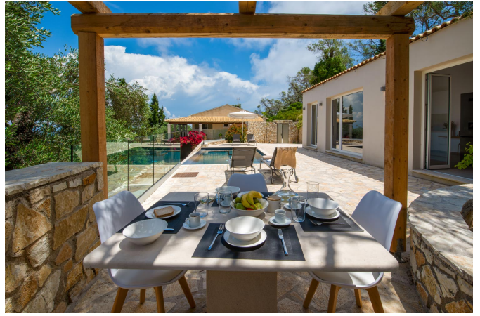
Showing first 18 photos.