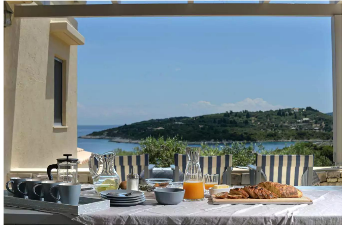
Showing first 18 photos.