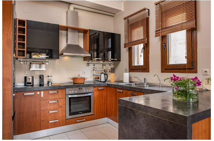
Showing first 18 photos.