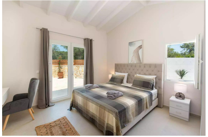
Showing first 18 photos.