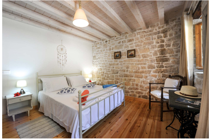
Showing first 18 photos.